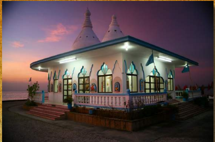
“ SEWDASS SADFHU’S TEMPLE IN THE SEA ”