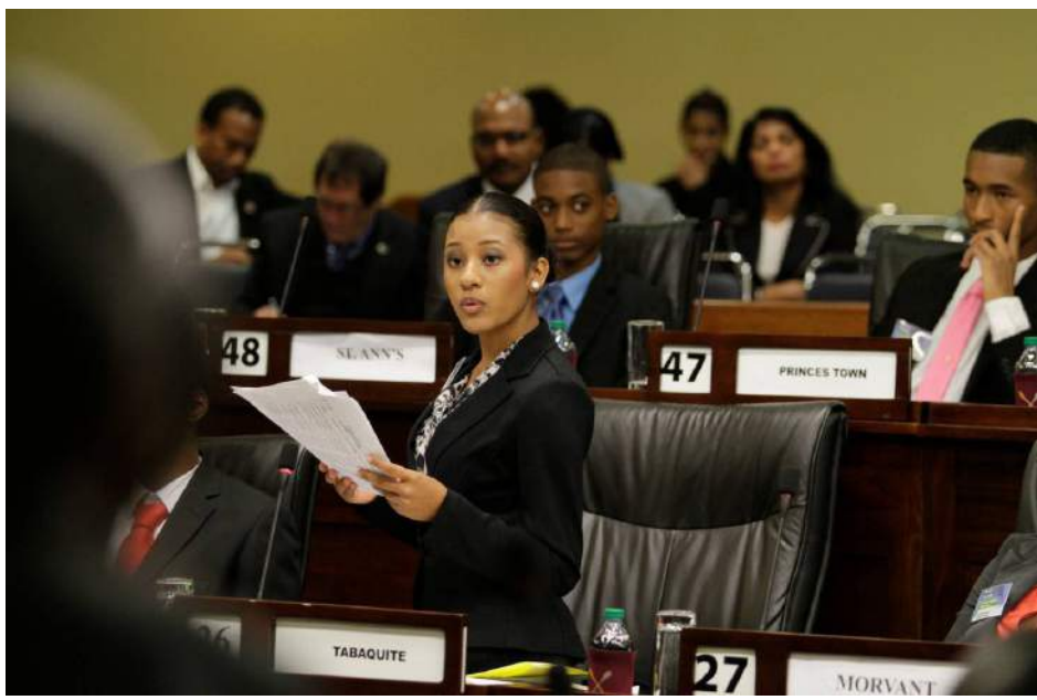
“ The Leader of the Opposition ”