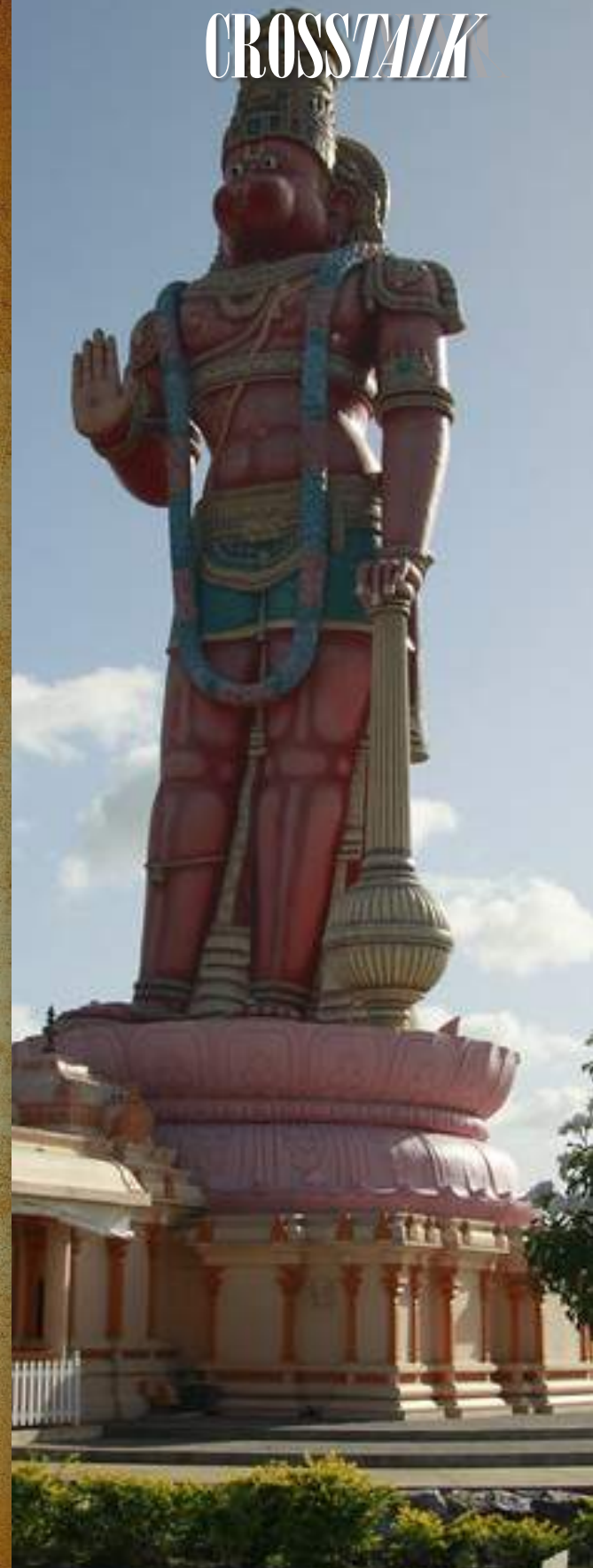
“ HANUMAN MURTI ”