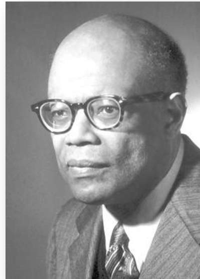
" SIR WILLIAM ARTHUR LEWIS"

https://www.ethnologue.com/country/LC/languages http://www.britannica.com/EBchecked/topic/517673/Saint-Lucia http://www.mls.lc/realestate/History.aspx