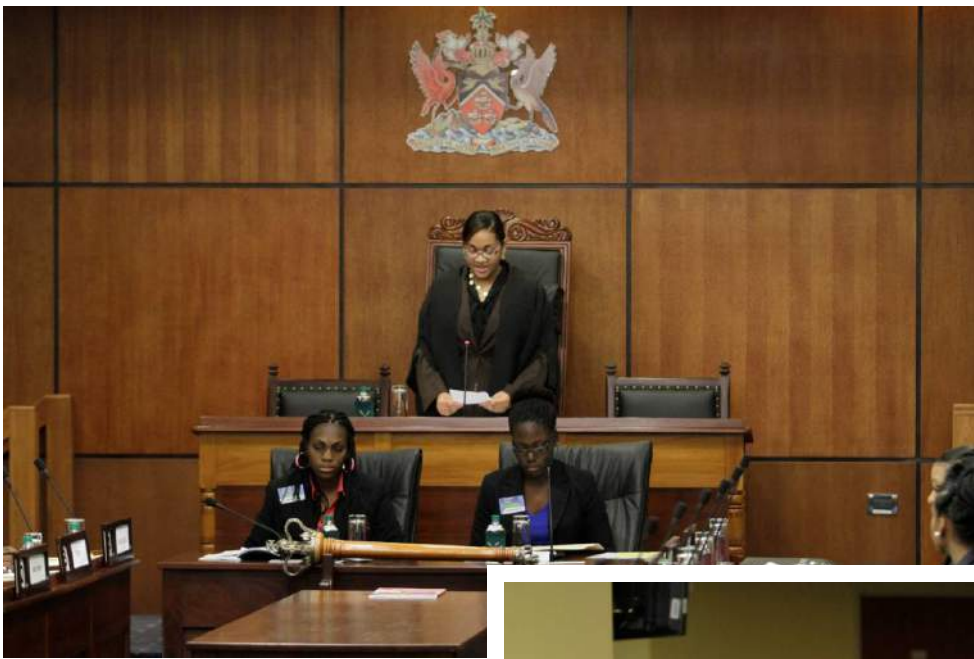
“Madam Speaker is on her Legs”