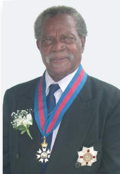
"DUNSTON ST. OMER"